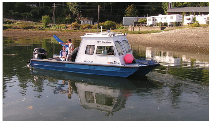
The APL-UW research vessel M/V Mackinaw with ACT and NOAA Pacific Marine Environmental Laboratory staff aboard

NANOOS is pleased to be part of ACT's demonstration project and to facilitate the increased use of pCO 2 sensors for coastal monitoring.